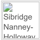
Sibridge Nanney- Holloway

“ 1 file added to the album Life Tributes